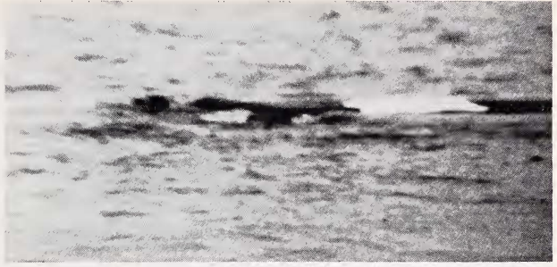
Fig. 4. Two whales lie side by side. The prominent white patch on the dorsal surface served to identify one animal. (Photo from ciné-sequence)

before it foaming white water; the flukes did not appear. The fifth breach commenced as did the third, but the flukes protruded symmetrically above the surface and revolved as they disappeared, indicating that the animal had twisted sideways underwater. On the sixth breach, the whale appeared 45^\circ to the horizontal, again on its side, twisting to strike